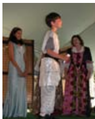
Cinderella Community Theatre August