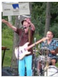
Family rockers Dog on Fleas August