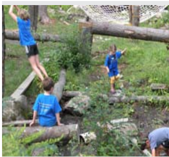
Kids enjoying "the Bog," part of the new natural playground.