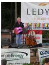
Folk legend Tom Rush August