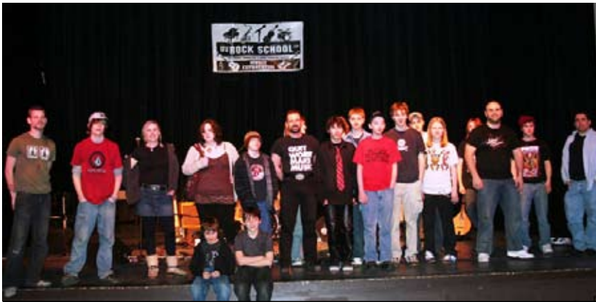
Members of the 8 bands that performed on April 1, 2008 in the "No Foolin'" Show at Lebanon Opera House gather on stage, after their shows.

In addition to the in-kind, in-person and in-cash support Rock School has received from so many local individuals, companies, and parents in the Upper Valley, we are proud to report the receipt of grants from the Vermont Arts Council/National Endowment for the Arts and a State of Vermont human services department. The VAC and NEA grant covers the costs of public performances in area towns and the human services grant purchased a mixing board for the classroom.