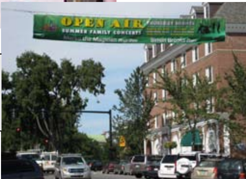
Open Air banner over Main Street in Hanover