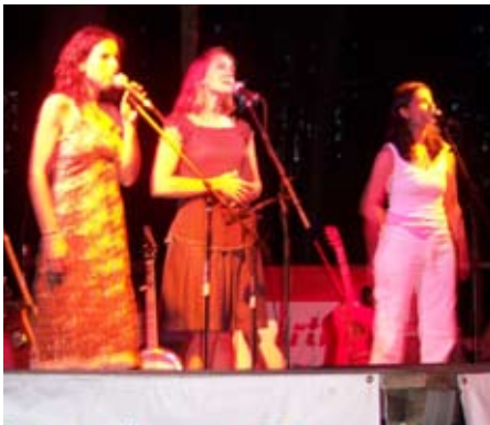
Folk/ Country trio Red Molly performing on a warm July evening.